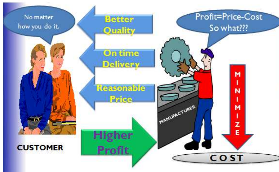
Figure 2.1 customer identification

At all conveyance points, note the conveyance distance and type of conveyance. At all retention points, note average work-in- process inventory.