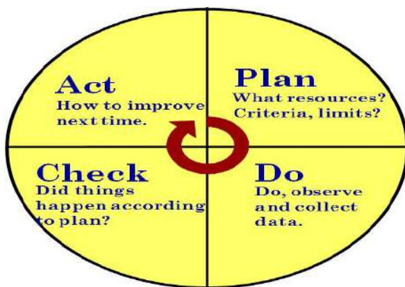
Figure 1.1 PDCA cycle

Procedures describe a process, while a work instruction describes how to perform the conversion itself. Process descriptions include details about the inputs, what conversion takes place (of inputs into outputs), the outputs, and the feedback necessary to ensure consistent results. The PDCA process approach (Plan, Do, Check, Act) is used to capture the relevant information.